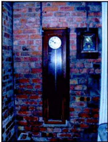
The Master Clock and the Striking & Chiming timer.