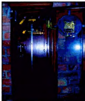
Close up of Master Clock.